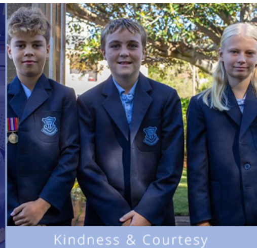
Kindness & Courtesy