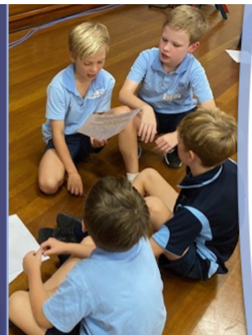
Kindness & Courtesy