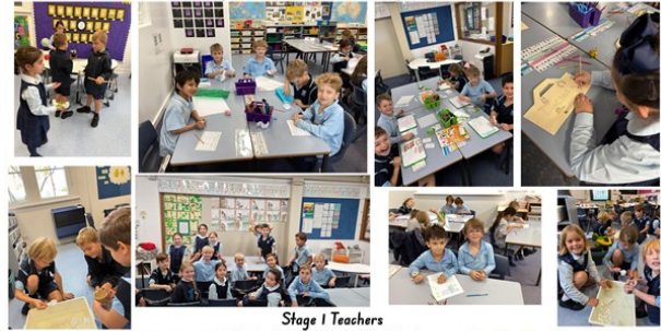
Stage 1 Teachers

Stage 1 | 1 Green, 1/2 Silver & 2 Blue | Term 1 Week 3 Welcome back to Term 2. We have another busy term planned with some exciting events including Dance Curriculum and an upcoming excursion to the Botanical Gardens in Week 4. The students have begun the term with enthusiasm and a positive attitude for learning. Classes have been busy with hands-on maths lessons, investigations in science, fun writing lessons and of course plenty more engaging lessons including CAPA, PDHPE, STEM, Library, Toolbox and French.