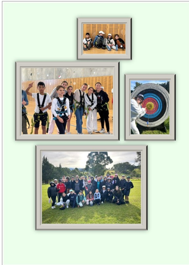
Bronze & Silver Awards Term 2 Week 6